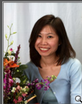
A final Silicon Film image