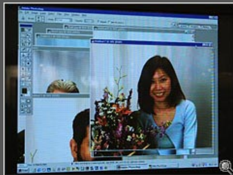
Three images transferred and ready for saving