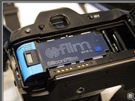
EFS-1 inserted into camera