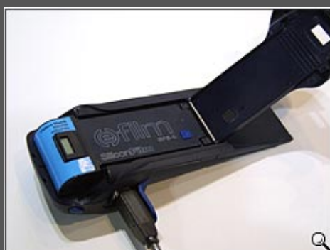
EFS-1 being inserted into e-port