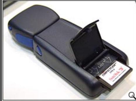
e-port inserted into e-box for "in the field" download onto CompactFlash cards (Type I/II)