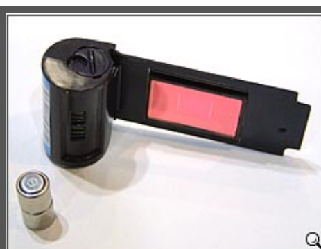
EFS-1 and its two batteries (good for several hundred shots)