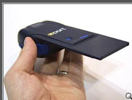
e-port (note PCMCIA connector, can be inserted directly into a PCMCIA slot for download)